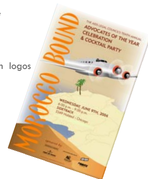
Poster with logos