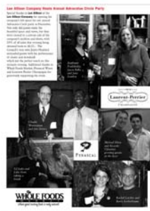
Newsletter article with corporate logos.