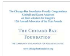
1/2 page sample