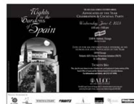
1/2-page ad with logos.