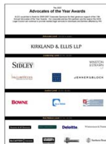
Corporate logo signage at event